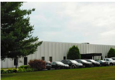
Fresenius Medical Care North America