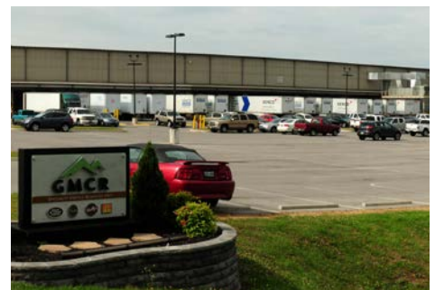
Keurig Green Mountain, Inc.