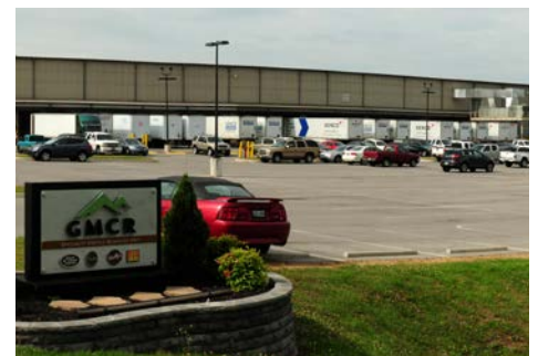
Keurig Green Mountain, Inc.