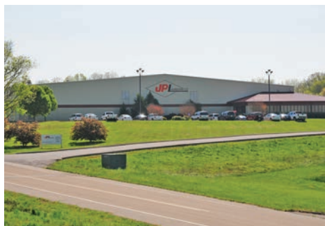
JP Lamborn Company