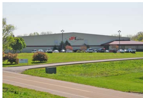
JP Lamborn Company