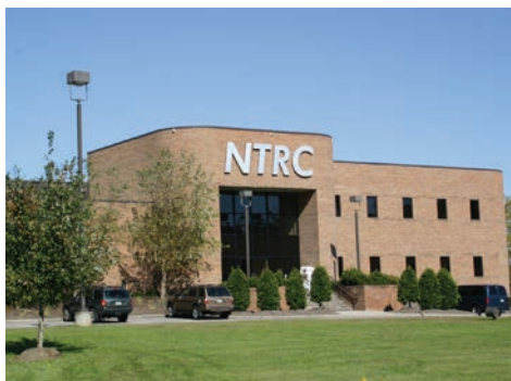
National Transportation Research Center