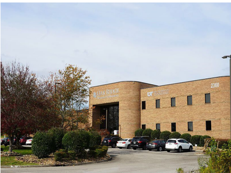
Oak Ridge National Lab